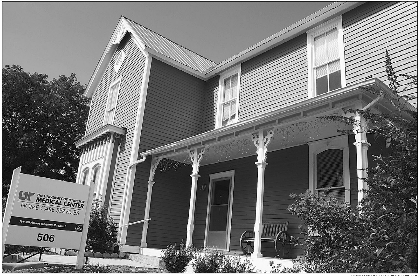
The Victorian house at 506 Mulberry St., Loudon has new life today as office spaces for University of Tennessee Home Care Services.